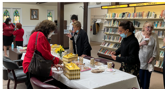
Welcome Back Coffee Hour May 1